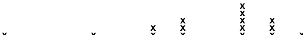
Social Studies Review Game Scores